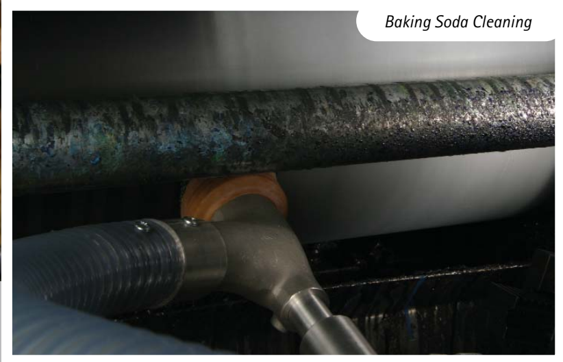
Baking Soda Cleaning